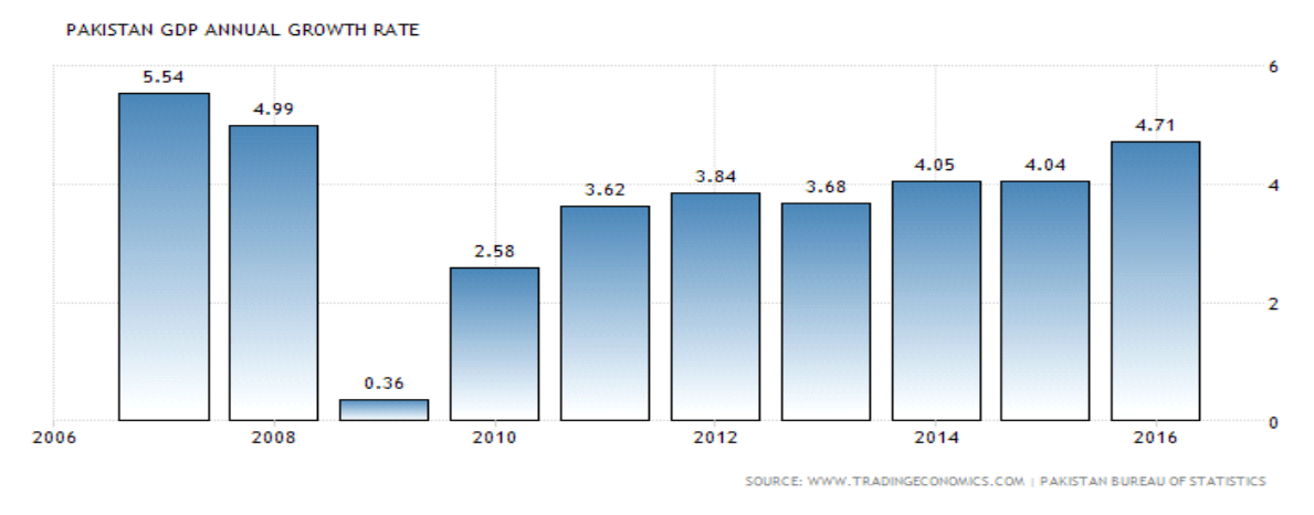
Figure 1. GDP (Economics, 2019)

Pakistan is currently being on the 38<sup>th</sup> position via economics point of view in which its nominal calculated GDP id $285.77 billion with the enlargement rate of GDP 4.91 from the year of 2016 the different values chart is mention below;